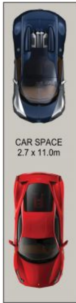
CAR SPACE 2.7 x 11.0m