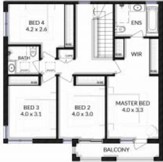
FIRST LEVEL FLOOR PLAN

INTERNAL AREA - 213m 2 LAND AREA - 317m 2