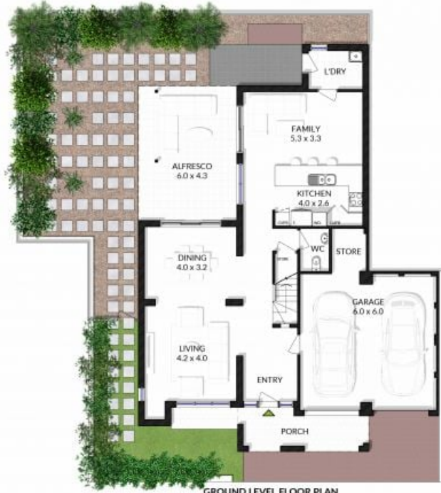
GROUND LEVEL FLOOR PLAN

INTERNAL AREA - 213m 2 LAND AREA - 317m 2